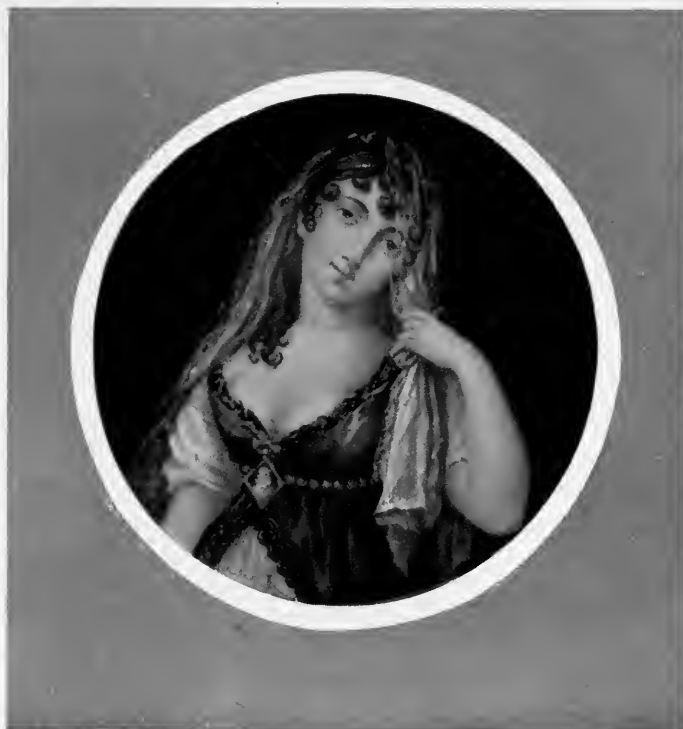
MADAME RÉCAMIER BY J. B. JACQUES AUGUSTIN

1 2 3 4 5 6 7 8 9 10 11 12 13 14 15 16 17 18 19 20 21 22 23 24 25 26 27 28 29 30 31 32 33 34 35 36 37 38 39 40 41 42 43 44 45 46 47 48 49 50 51 52 53 54 55 56 57 58 59 60 61 62 63 64 65 66 67 68 69 70 71 72 73 74 75 76 77 78 79 80 81 82 83 84 85 86 87 88 89 90 91 92 93 94 95 96 97 98 99 100